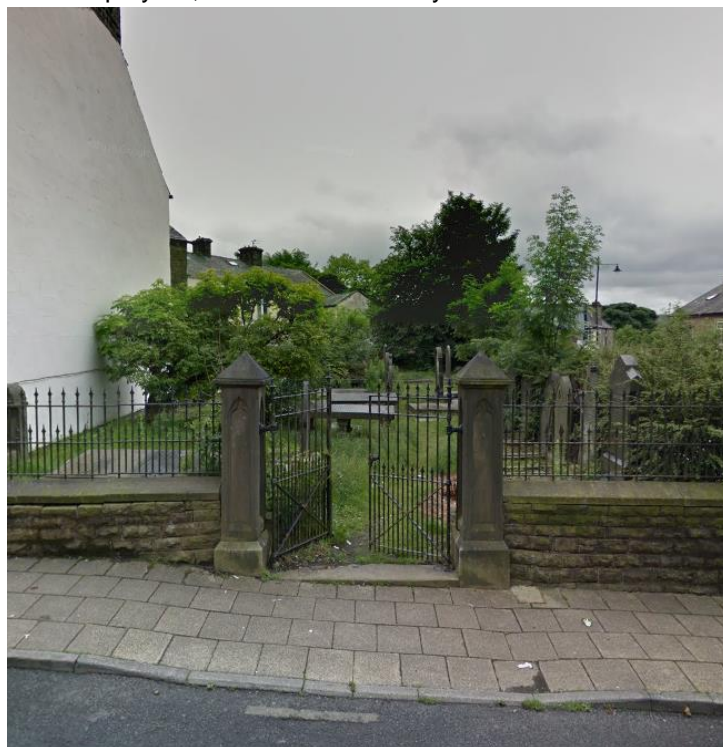
Photo of Pte J. Clark's Commonwealth War Graves Commission Headstone in Haslingden Old Congregational Chapelyard, Lancashire, England.

Haslingden Old Congregational Chapelyard, Lancashire has only 1 Commonwealth War Grave.