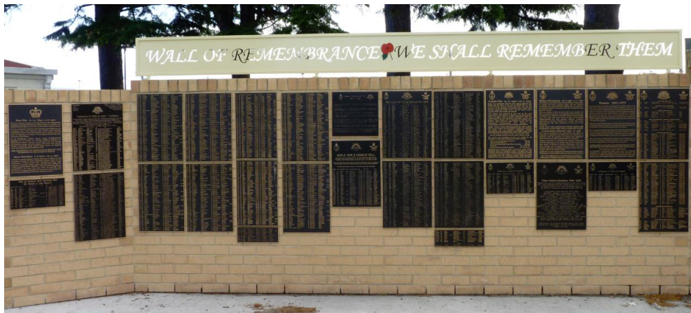
Wall of Remembrance, St. Helens, Tasmania

"What these men did nothing can alter now. The good and the bad, the greatness and the smallness of their story will stand. Whatever of glory it contains nothing now can lessen. It rises, as it will always rise, above the mists of ages, a monument to great hearted men; and for their nation, a possession forever."