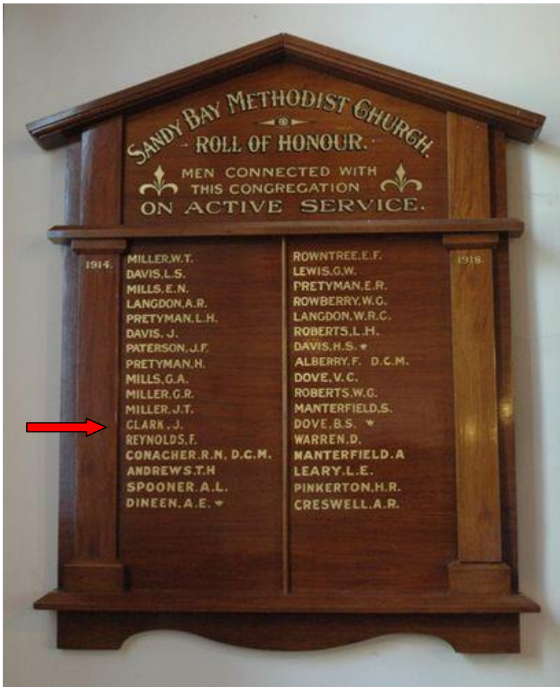
Sandy Bay Methodist Church Roll of Honour