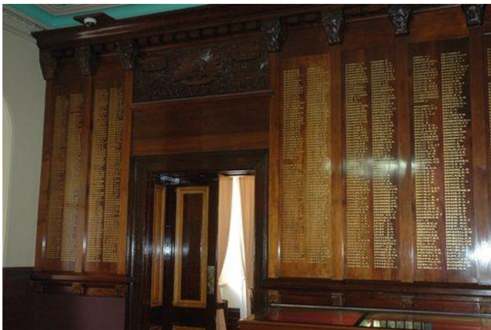
Hobart Roll of Honour